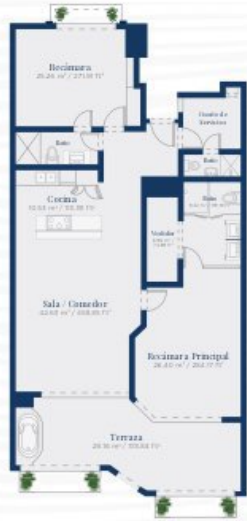
B Department 2 Rooms | 3 Bathrooms Total Area: 165.05 m 2 / 1,776.62 ft 2