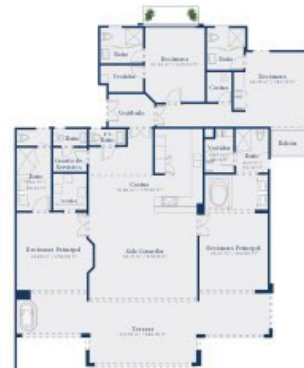
E Department 4 Rooms | 5.5 Bathrooms Total Area: 305.69 m 2 / 3,290.45 ft 2