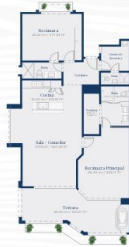
C Department 2 Rooms | 3 Bathrooms Total Area: 171.10 m 2 / 1,841.73 ft 2